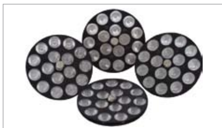
LL VARIO OPTIC SPOT 16