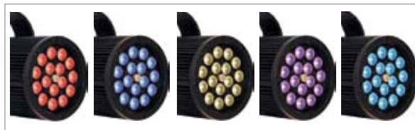
Dynamic colour variations